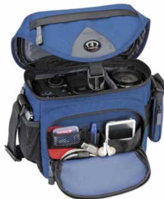
Explorer 200 Model 5562