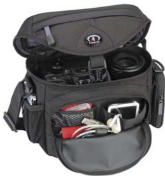
Explorer 100 Model 5561

Tamrac's new Explorer Series combines unparalleled protection, extensive features and a great modern design to provide the ultimate carrying solution. These slim-profile bags allow quick access to digital SLRs with lenses attached, as well as necessary photo accessories and personal items.