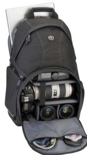
Speed Pack 85 Model 3385

Speed Pack 75 – Dual Access Photo Backpack , Model 3375, holds and protects a DSLR with a 7” lens attached, 1-2 additional lenses and accessories.