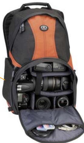
Speed Pack 75 Model 3375

Side door zips open for fast access to camera gear while packs are worn over one shoulder. Equipment can also be accessed through the front panel when the packs are removed like traditional backpacks.