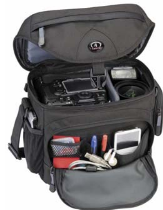
Explorer 400 Model 5564